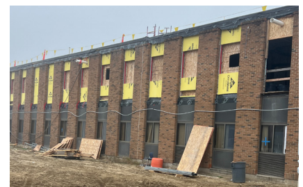
Above: Exterior building finishes is ongoing.