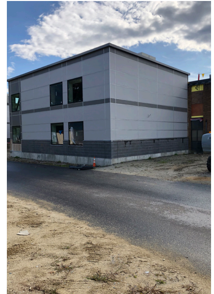
Above: Exterior building finishes is ongoing.

Phase 9: The final phase includes the renovation of the balance of the existing 1st floor classroom wing, and miscellaneous exterior work on and around the building.