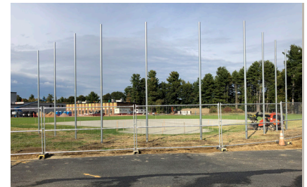
Above: Softball field backstop installation.